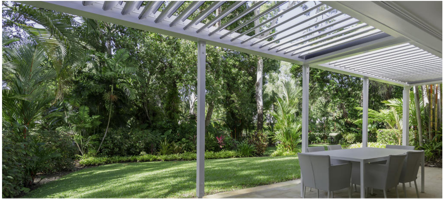
Mirage Villa 120 Bougainvillea Way, Port Douglas