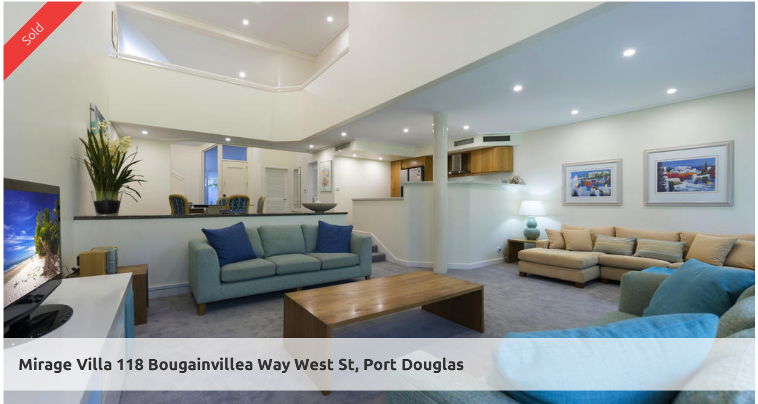
Mirage Villa 118 Bougainvillea Way West St, Port Douglas