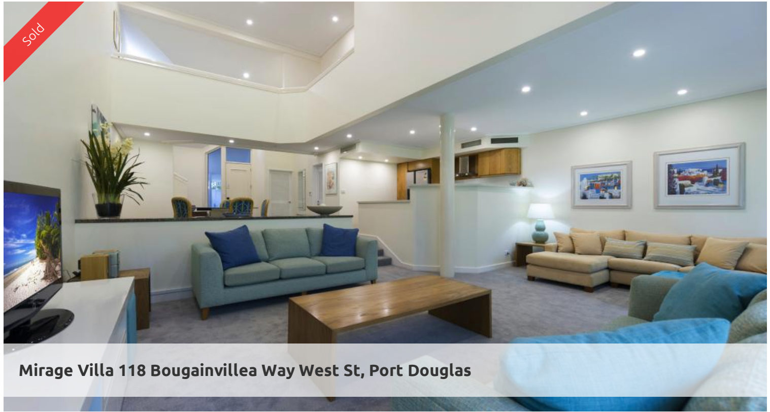
Mirage Villa 118 Bougainvillea Way West St, Port Douglas